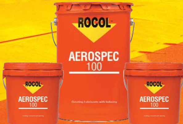
Aerospec 100 Semi-Fluid Grease